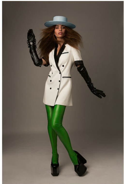
THE FASHION FORWARD abito-giacca, NESSE, giacchi in pelle MALAN BRETON, polsini in pizzo di plastica ADA ZANDITON COUTURE, cappello JACQUELINE LOEKITO, stivali alti in gomma NATACHA MARRO