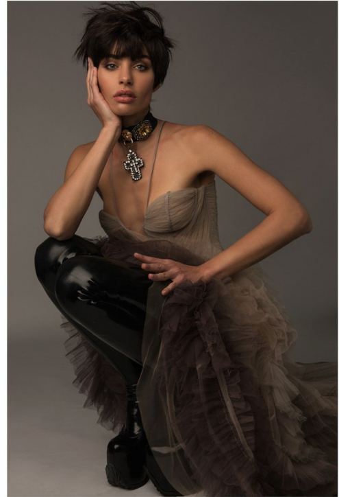
THE SENSUAL abito di organza in pizzo HASSIDRESS, gioiello con gioiello a forma di croce PK BIJOUX, stivali in gomma alti NATALIA MARRO