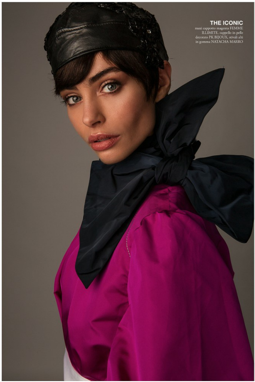
THE ICONIC maxi cappotto magenta FEMME ILLIMITE, cappello in pelle donna PERBOLA, stivali alti in gomma NATACHA MARRO