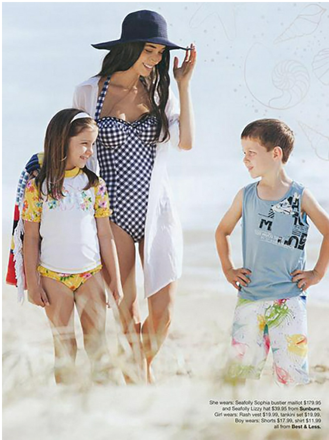
She wears: Seafolly Sophia bustier mallox $179.95 and Seafolly Lizzy hat $39.95 from Sunburn. Girl wears: Flash vest $19.99, tankini set $19.99. Boy wears: Shorts $17.99, shirt $11.99 all from Best & Less.