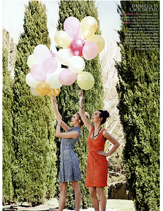
DAMSELS IN LACE DETAIL. LEFT PAGE: LEVEE dress, $296; Lingerie earrings, $14.99; Collette cuff, $12.95; Tony Bianco heels, $189.95. RIGHT PAGE: Collette by Collette Draper dress, $399; 8 Other Research necklace, $49.95; Collette floral bracelet, $14.95; Gamartha Mills jewelry & Luvr gold baroque $150; Lard & Pop Song Linger gold bangle, $100; Kourt Walker shoes, $99 each; 2013 Claret heels, $189.95; balloons supplied by Concept and Party.com/idea.com/usa.