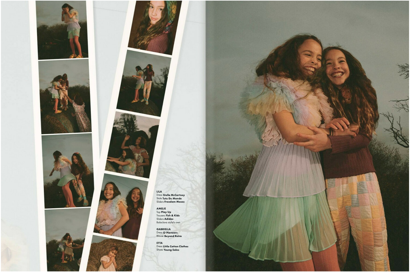
LILA Dress: Stella McCartney Socks: Tufu Du Monde Slides: Freedom Moses AMELIE Top: Play Up Trousers: Fish & Kids Slides: Adidas Ballerina: myli's own GABRIELLA Dress: O'Wanners Blouse: Beyond Retro ETTA Dress: Little Cotton Clothes Shoes: Young Soles