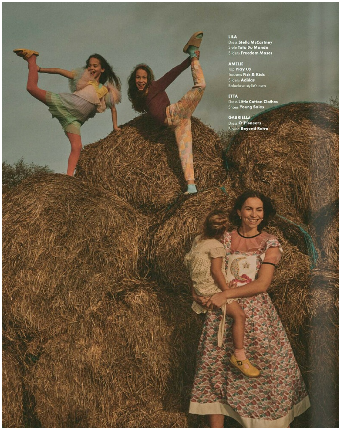
LILA Dress Stella McCartney Shoes Ritu Du Mendr Sliders Freedom Westes AMELIE Top Play Up Trousers Fish & Kids Sliders Adidas Bobolona stylar's own ETTA Dress Little Cotton Clothes Shoes Young Soles GABRIELLA Dress O'Pioneers Slippers Beyond Retro